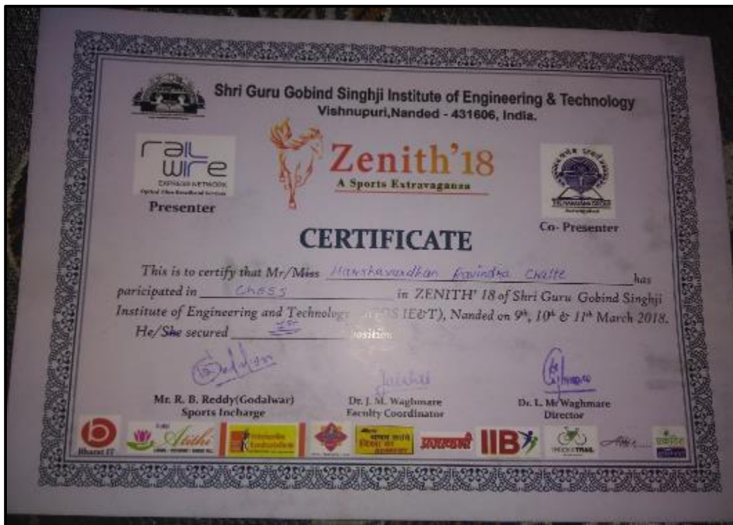
Harshvardhan Chatte: Inter University (chess) 1 st Position (2017-18)