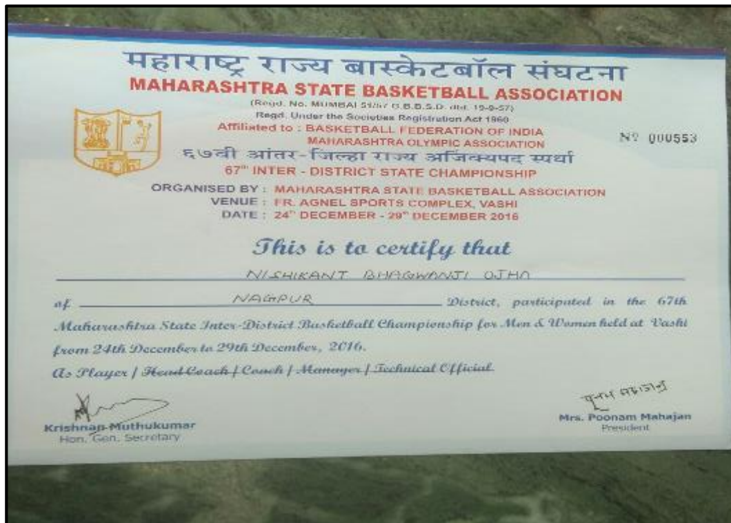
Nishikant Ojha: District level Championship (Basket ball) (2016-17)