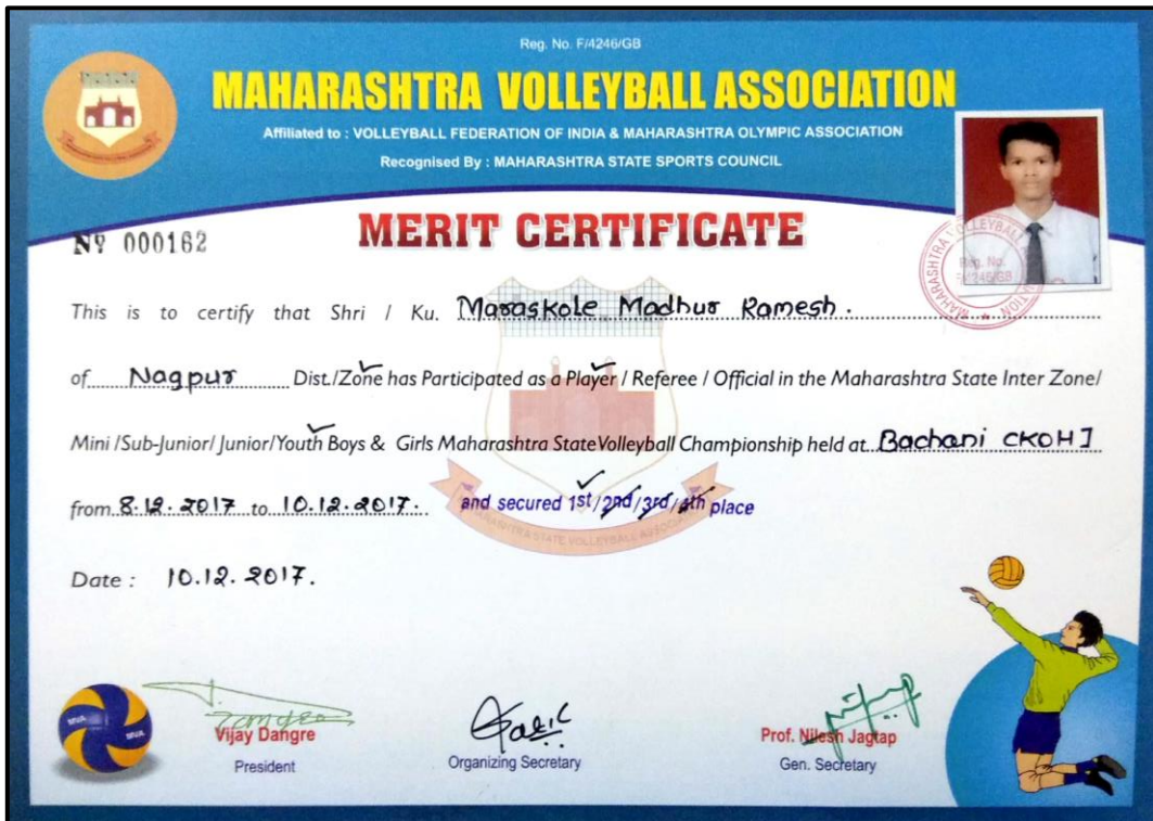
Madhur Maraskole: Youth State Championship (Volleyball) (2017-18)